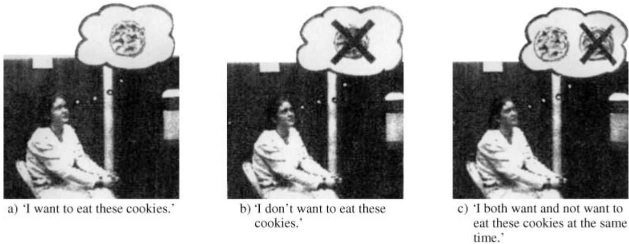
Figure 2 Pictures and corresponding states of mind presented in the Cookie condition in Study 2. Pictures (a) – the Want state and (b) – the Not Want state – showed the presence of one state of mind while Picture (c) illustrated a conflicting state of mind – the Internal Conflict state.